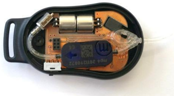
Figure 2: Micropump mp6-AIR integrated in a portable system for NPWT.

System consists of check valve mp-cv, micropump mp6-AIR, pressure sensor and battery powered electronic.