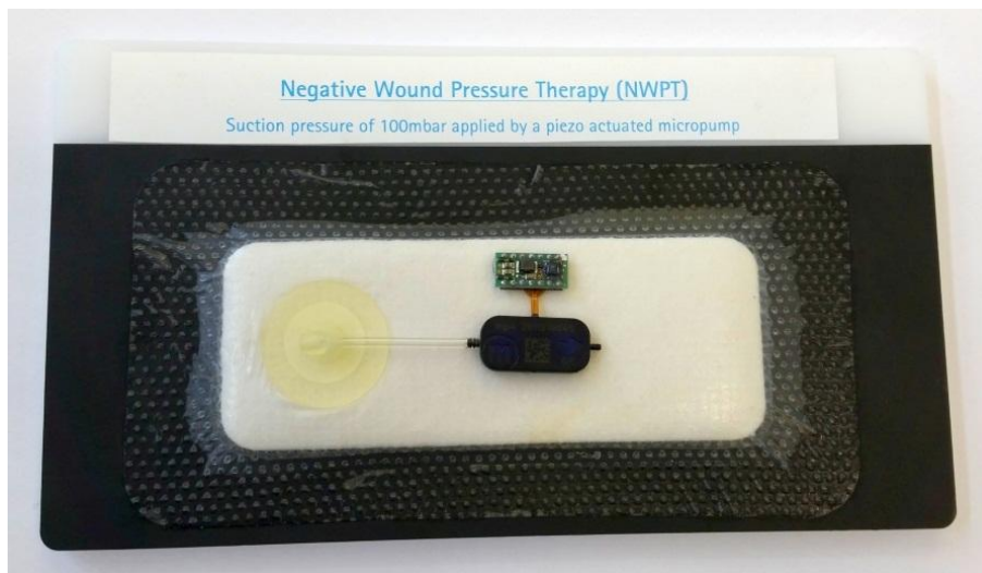
Figure 1: Wound pad with the mp6-AIR micropump and the mp6-OEM controller.

With our flat micropump we have the possibility to implement the proven technology for portable applications.